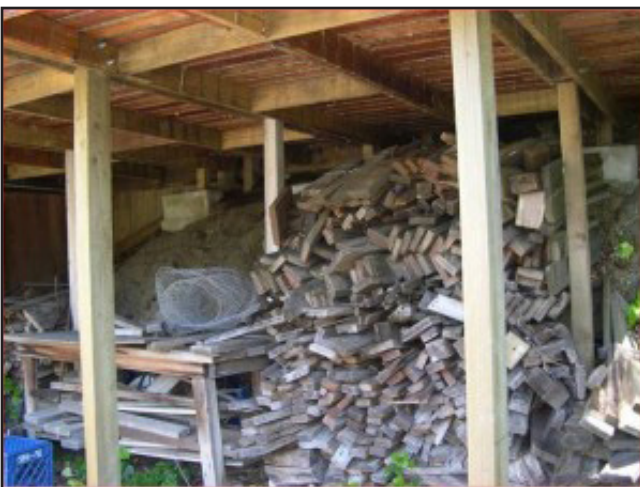
No deck, regardless of the material used to build it, would be safe if this amount of fuel beneath the deck caught fire. Even decks that may have a noncombustible surface, such as concrete, use lumber and timbers for structural support and those materials can catch fire.