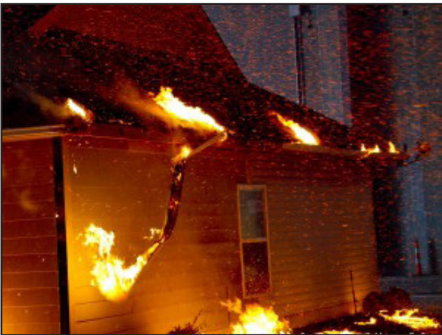
This photo shows how gutters filled with debris can be ignited by wind-blown embers that land there. Once ignited, the edge of the roof and fascia are exposed to direct flame contact.

Suitable construction materials offer a home the best chance to survive a wildland fire. Embers from a wildland fire can find the weak link in your home's fire protection scheme and gain the upper hand due to a small, overlooked or seemingly inconsequential factors. However, there are measures you can take to safeguard your home from wildland fire. While you may not be able to accomplish all the measures listed below, each will decrease the ignitability of your home and increase its chances of survival during a wildland fire.